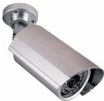
Weatherproof IR camera with 3-Axis bracket IR Distance 20 M